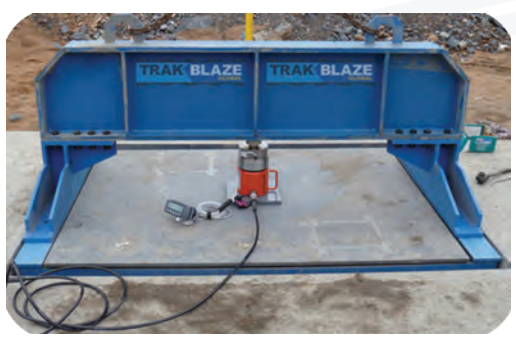
FORCE being tested and calibrated at site with the portable test press unit.

Accuracies of ±0.05 in static mode and ±0.5% in dynamic (in-motion) mode approximately, are achievable dependent upon the site conditions and the operator.