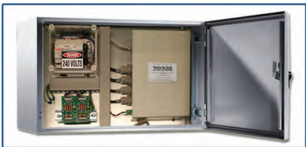
Optional - Tough Rack Mounted Rittal Enclosure

Whatever your workplace or challenging environment is, the FORCE 1 system and Trakblaze has the solutions to ensure your loads are weighed with unbeatable Speed and Accuracy. The FORCE 1 system SAVES time and MONEY by weighing on the go.