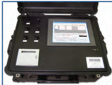
Optional - Portable Touch Screen Hardcase